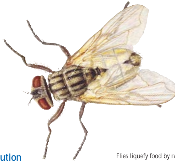
Common Housefly 14mm wingspan

Adults, 6mm long with 12mm wingspan; grey thorax with 3 longitudinal stripes, less pronounced than those of Common housefly; extensive yellow patch at base of abdomen; at rest, wings are folded along back; venation shows 4th vein extending straight to wing margin.