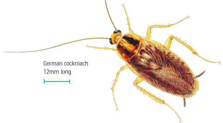
German cockroach 12mm long

Cockroaches and their faeces may cause allergic reactions especially amongst sensitive individuals eg asthmatics. Exposure may result from ingestion or through the inhalation of materials derived from cockroaches in airborne dust. In addition, food may be tainted with the characteristic smell of the cockroach, which is produced by faeces and salivary/abdominal gland secretions, or by the dead insects.